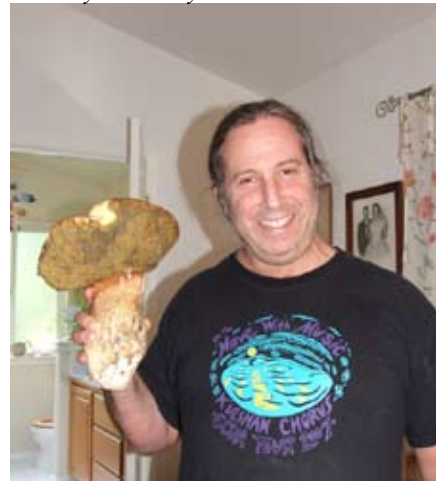
Massive mushroom, a statly spring king