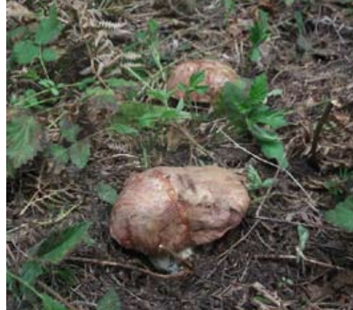
Boletus rex-veris , in situ