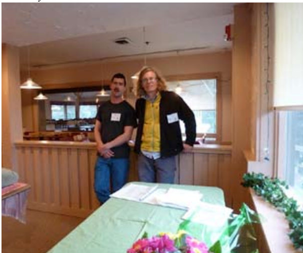
The calm before the storm