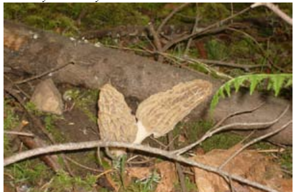
Top and bottom photos, two different morels! See Fred's article on page 7 for more insight.