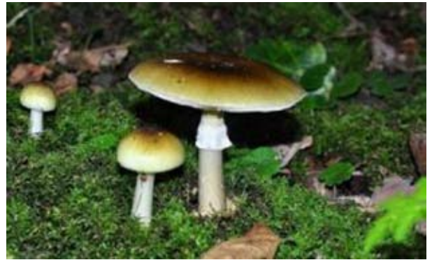
A. phalloides