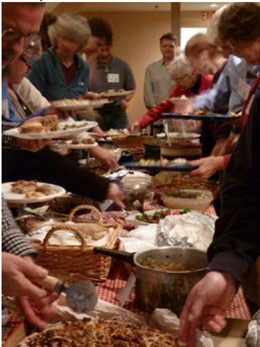
Survivors try ing to maximize their plate space!

The 2012 mushroom season was officially heralded in by the NMA Survivor's Banquet, and as usual, it proved to be a gala event. Each year,, it seems, the dishes prepared by the members become tastier and more refined. Since the membership has grown significantly over the past 3 years, there is also more to choose from, making it a genuine challenge to actually taste some of everything. It takes creative arrangement on one's plate to maximize the variety, but it is most certainly worth the effort.