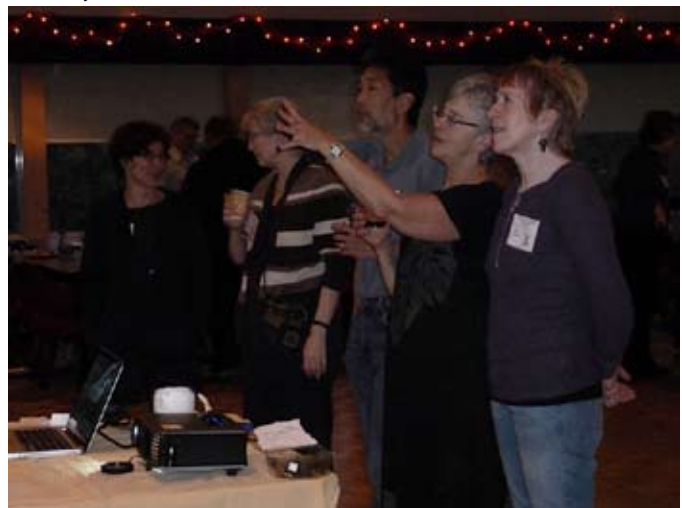
Northwest Mushroomers in awe of fall finds.