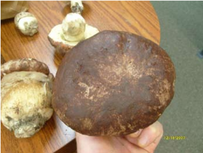
The spring king, in all of its glory